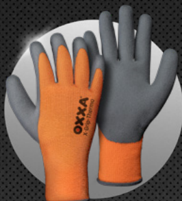
X-GRIP-THERMO 51-850 Art. no. 1.51.850.00