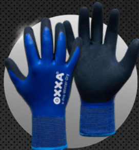
X-PRO-WINTER-DRY 51-870 Art. no. 1.51.870.00